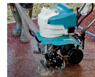
Wholly washable design Except Handle section.