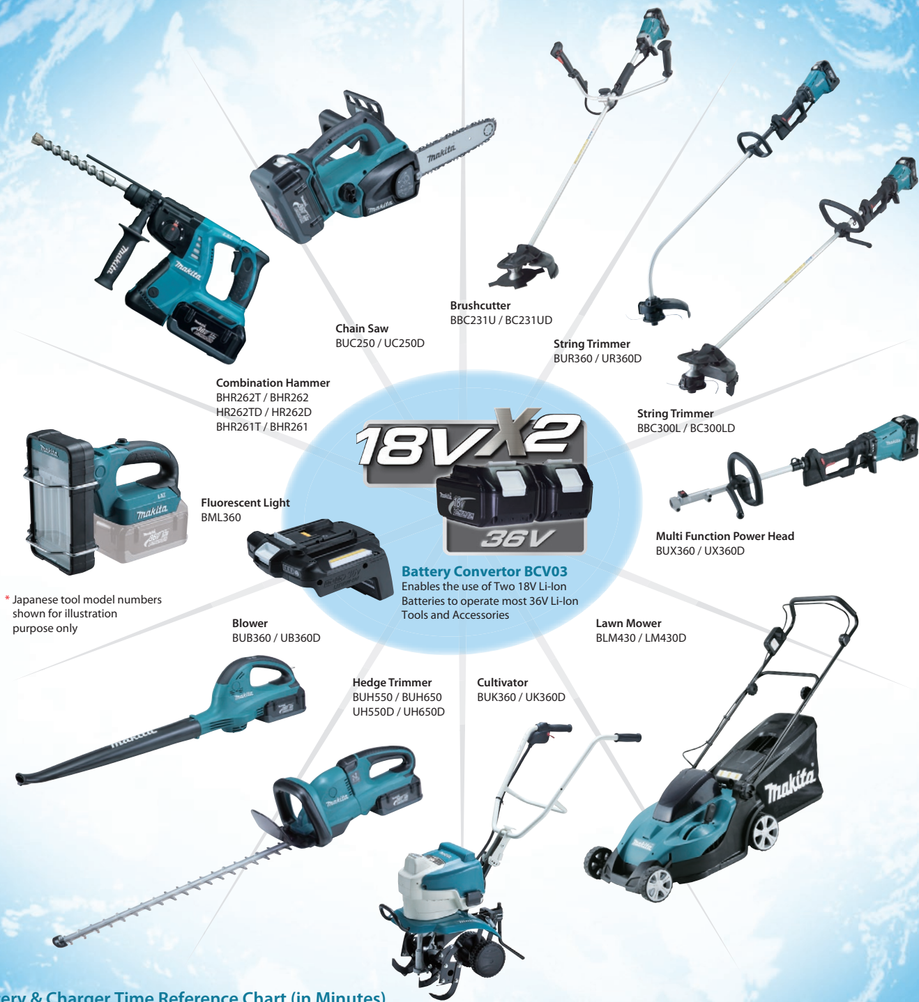
Chain Saw BUC250 / UC250D