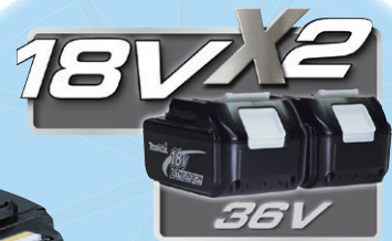
Battery Converter BCV03 Enables the use of Two 18V Li-Ion Batteries to operate most 36V Li-Ion Tools and Accessories

* Japanese tool model numbers shown for illustration purpose only