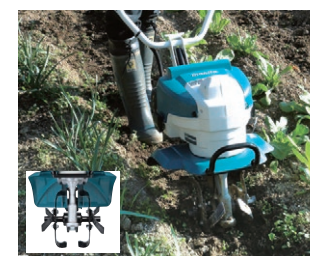
Intertilling and Grass Removal