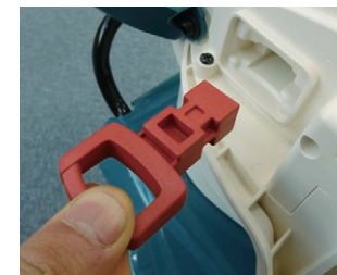
Child lock key